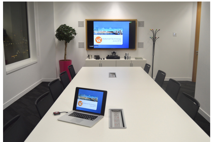
Dotmailer Board Room with Barco Clickshare Content Sharing